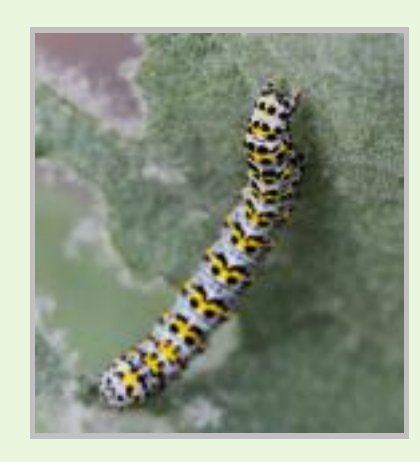
Mullein moth larva

Roger Forster reports from Home (SU592993) where the following observations were made: Mullein moth (10 Larval "On a mullein in my garden").