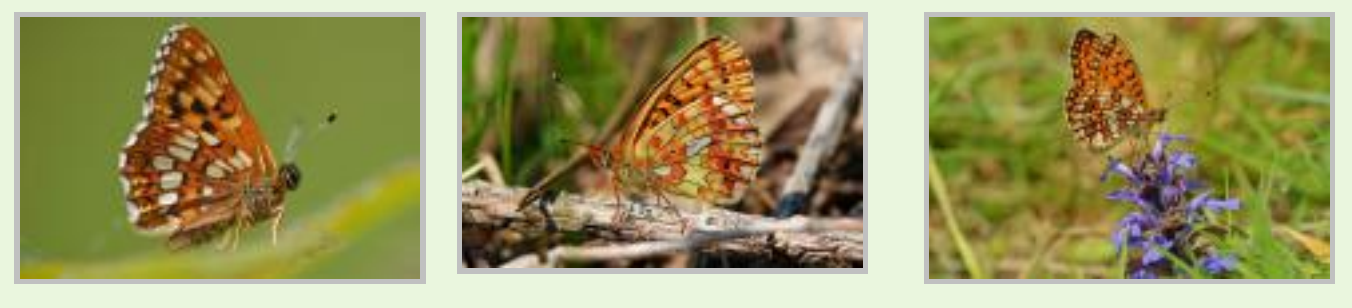
Duke of Burgundy

Mark Pike reports from Bentley Wood(Eastern Clearing) (SU262293) where the following observations were made: Brimstone (30), Duke of Burgundy (4), Grizzled Skipper (1), Orange-tip (2), Peacock (1), Pearl-bordered Fritillary (10), Red Admiral (1), Small Pearl-bordered Fritillary (4).